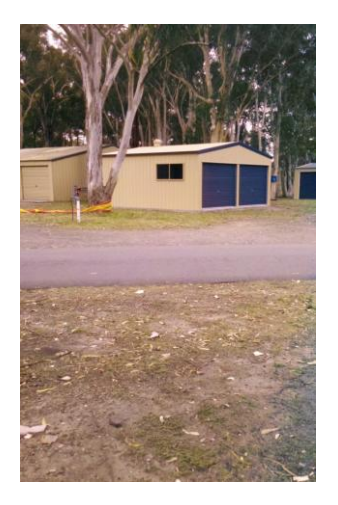
Our New Shed- Yea!